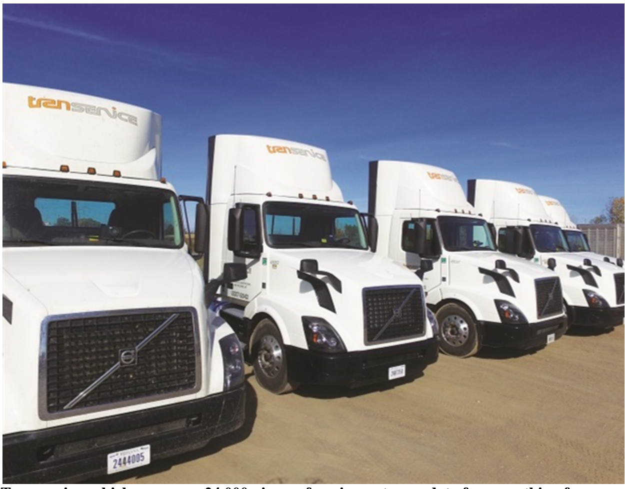
Transervice, which runs over 24,000 pieces of equipment, uses data for everything from analyzing spec'ing to meeting customer needs.