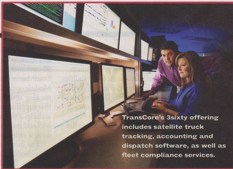
TransCore's 3sixty offering includes satellite truck tracking, accounting and dispatch software, as well as fleet compliance services.

"For example, a company may want to see where they made three deliveries to an account inside of a week